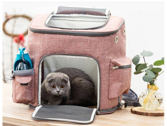
PCB-1309 Size: Open: 31X40X43cm Folded: 44X40X5cm other customized sizes.