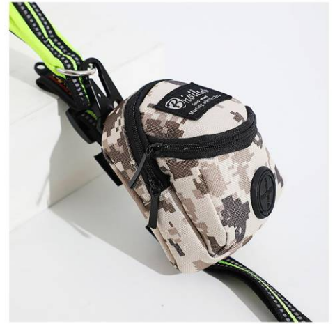
PCB-1336 Size: 12X8X8cm other customized sizes.