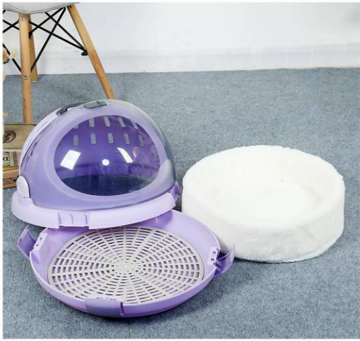
PCB-1319 Size: 40X36cm other customized sizes.