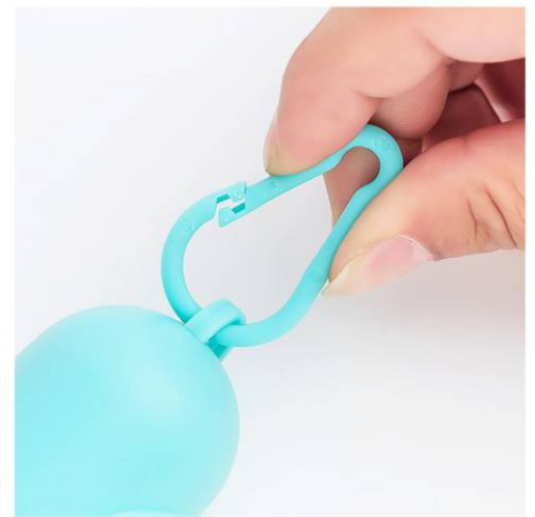
PCB-1343 Size: 9X4cm other customized sizes.