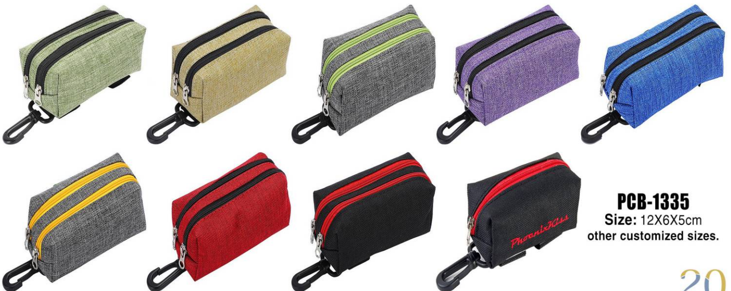
PCB-1335 Size: 12X6X5cm other customized sizes.