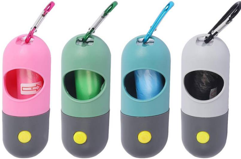
PCB-1341 Size: 11X4.5cm other customized sizes.