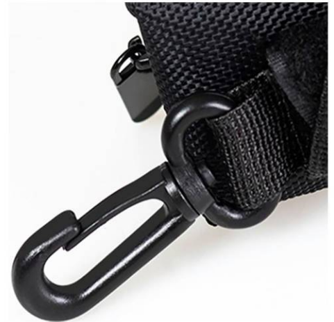
PCB-1337 Size: 9.5X5X5cm other customized sizes.