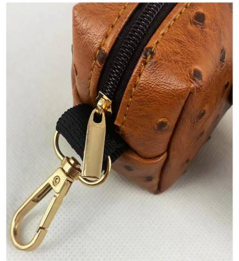
PCB-1340 Size: 9X5X5.5cm other customized sizes.