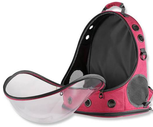
PCB-1325 Size: 37X28X41cm other customized sizes.