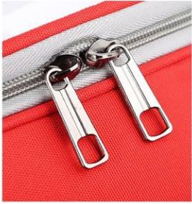
PCB-1318 Size: 31X42X28cm other customized sizes.