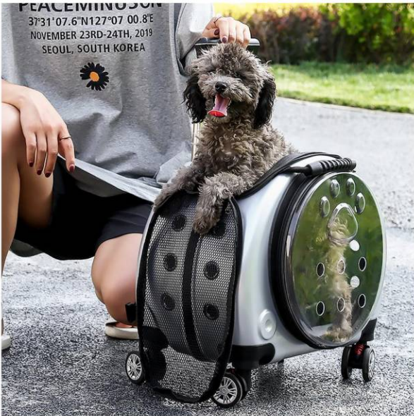
PCB-1322 Size: 44X35X37.5cm other customized sizes.