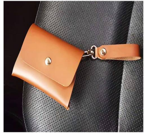
PCB-1338 Size: 9X7.5cm other customized sizes.