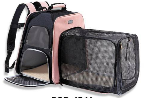
PCB-1311 Product Size: 40X39X28cm Folded: 40X40X8cm other customized sizes.