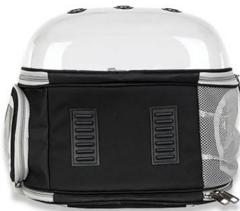
PCB-1320 Size: 31X42X29cm other customized sizes.