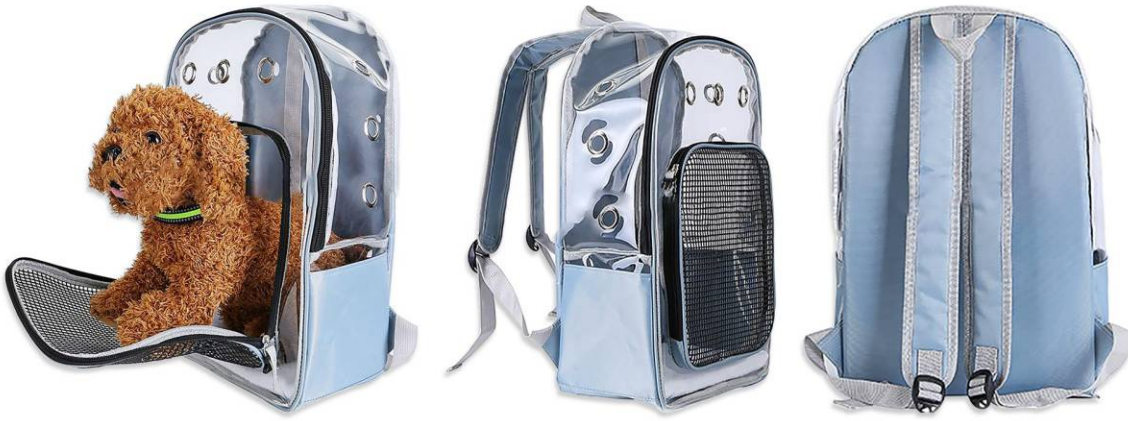
PCB-1334 Size: 30X15X45cm other customized sizes.