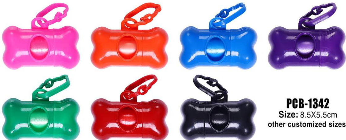
PCB-1342 Size: 8.5X5.5cm other customized sizes.