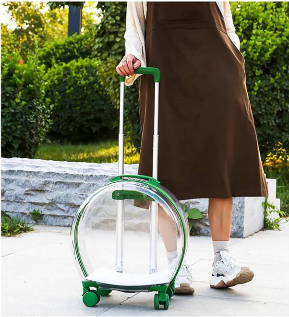
PCB-1321 Size: 42X50X25cm other customized sizes.